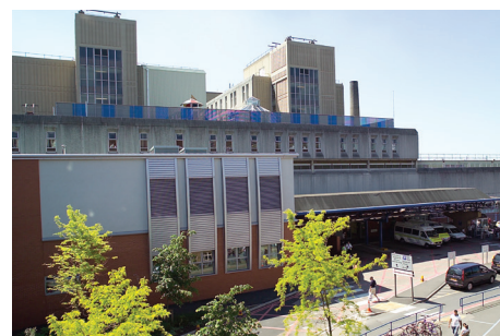
Leicester Royal Infirmary