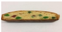
Fruit Sponge Cake Slice V E